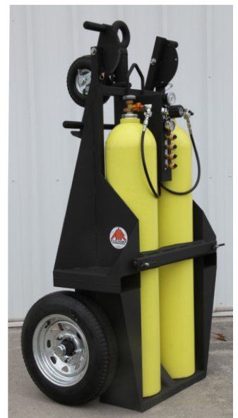
Store Upright For Smallest Footprint