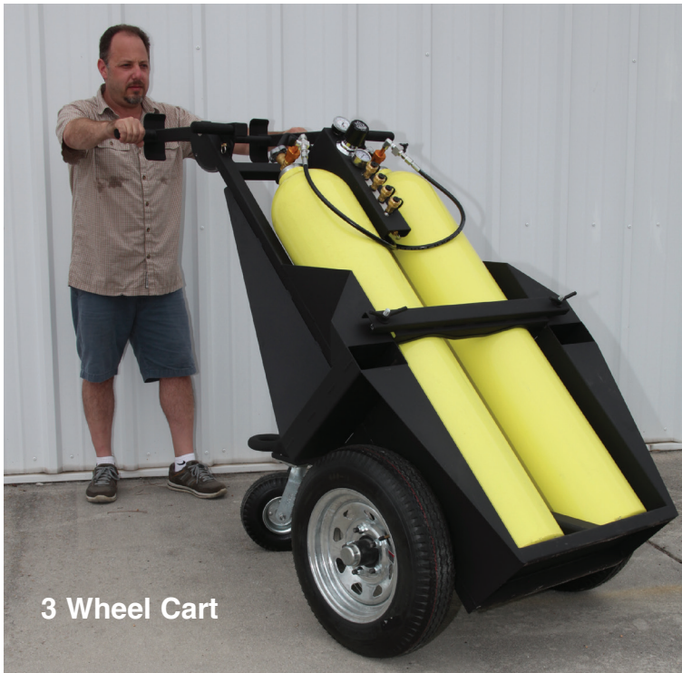
3 Wheel Cart